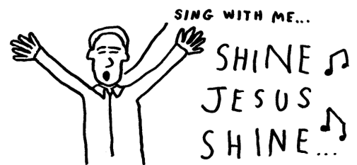
SOME ODD OR UNPREDICTABLE BEHAVIOUR