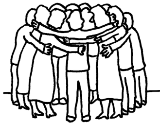
THE COMMENCEMENT OF A GROUP HUG