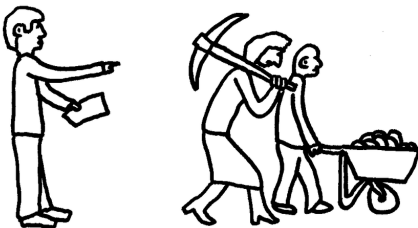
ORGANISING A WORK PARTY